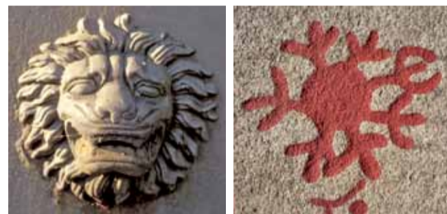
Swedish National Heritage Board 2013. Print: E-print AB 2013. Layout: Hedh & Franke/Helena Duveborg. Copyright license according to Creative Commons license CC BY. License at http://creativecommons.org/licenses/by/3.0/ .

For more information about the Convention and other World Heritage sites see UNESCO: whc.unesco.org The Nordic World Heritage Foundation: www.nwhf.no The Swedish National Commission for UNESCO: www.unesco.se